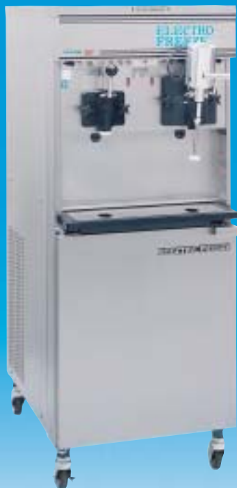
MODEL 15-77 RMT