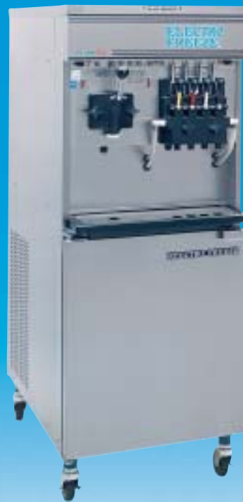
MODEL 15-10 CMT