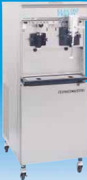
MODEL 15-77 CMT