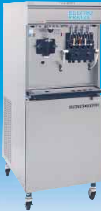
MODEL 15-10 CMT